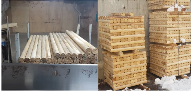
Figure 1: Peeler cores from the poplar wood.

Rongrong et al. (2015) considered different sawing methods of small-diameter round wood assortments 80 mm, 100 mm and 120 mm, respectively. They found that the average quantitative yields reached following values: R = 53,3\% for live sawing, R = 56,7\% for triangle sawing- R = 63,2\% for trapezoidal sawing and R = 82,7\% for hexagon sawing, respectively.