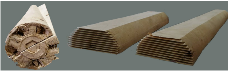
Figure 3: Test specimens of peeler cores lamellas for the production of glulam.

was applied in laboratory conditions (Figure 3).