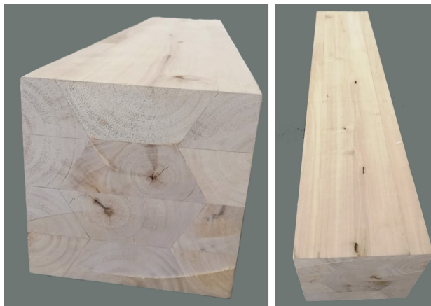
Figure 5: Glulam type glued beams.

According to the accepted methodology in laboratory conditions glulam with final cross-sectional dimensions - 126 mm x 131 mm was obtained (Figure 5).