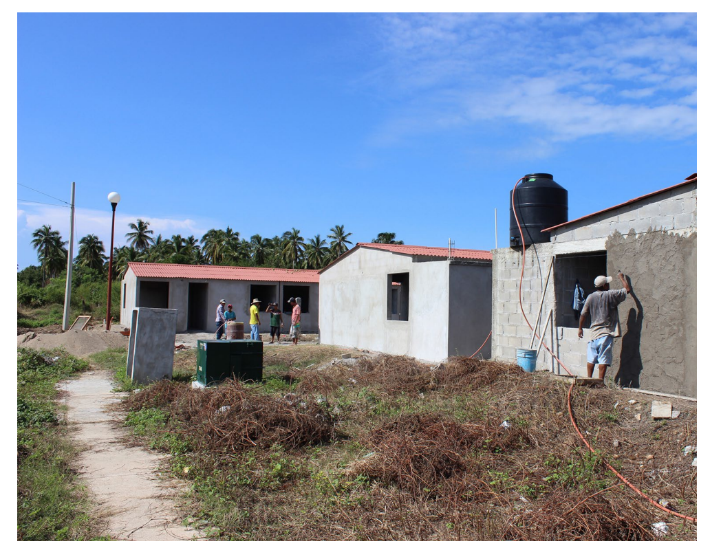
Figure 4. Housing for the affected in September 2018.