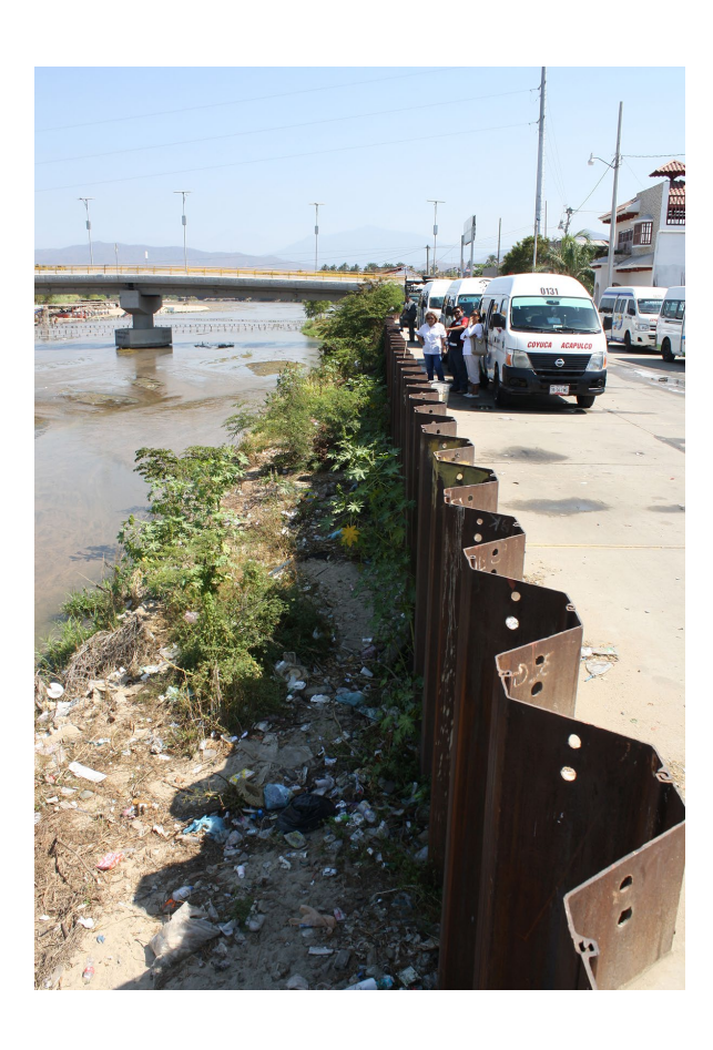
Figure 3. Protection curtain and Coyuca I Bridge in April 2017.

It is starting from and through said highly centralized and not very democratic institutional frameworks, that the specific ways of governance for the post-disaster public actions analyzed in this work are produced and reproduced: reconstruction of major infrastructure, public services, and housing. The following key elements are described below for each way of governance: key players, degree of participation of non-governmental players, alliances, and conflicts between players, and the results and impacts on risk reduction.