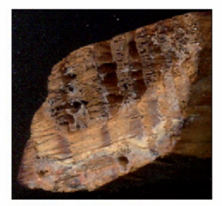
Figure 4. Details of degradation by Gloeophyllum sepiarium on non-impregnated pinewood (T_0) .

The Colatan IPG-F treatment showed weight loss of 29.26%, with significant differences as regard the rest of the treatments. This substance reduces the weight loss for 9,54 % with regard to the blank sample, achieving an increase in wood durability. According to Findlay scale, ASTM D 2017 (1981) wood turns to be non resistant (weight loss between 10 to 30%).