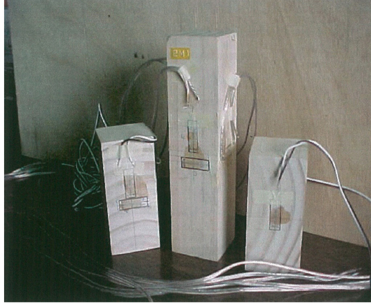
Figure 3: Wood samples with strain gauges for mechanical testing.

sured by strain gauge KL-10-120-A4 (Kyowa) placed in the wood sample according to the required strains, as shown in Figure 3. When the load was parallel-to-grain, i.e longitudinal direction, three strain gauges were placed in the sample. To obtain the elasticity moduli E_{LL} , one of the said gauges was placed along the longitudinal direction, and for the Poisson's ratio calculations \nu_{LR} and \nu_{LT} , the other two were placed along the radial and tangential directions, respectively. When the load was along the radial direction, only two strain gauges were placed in the sample. In this case, to obtain the elasticity moduli E_{RR} one strain gauge was placed along the radial direction, and for Poisson's ratio \nu_{RT} the other was placed along the tangential direction. When the load was along the tangential direction, only one strain gauge was placed in the sample in this direction to determine the elasticity moduli E_{TT} . Poisson's ratios \nu_{TR} and \nu_{TL} were determined using symmetry properties.